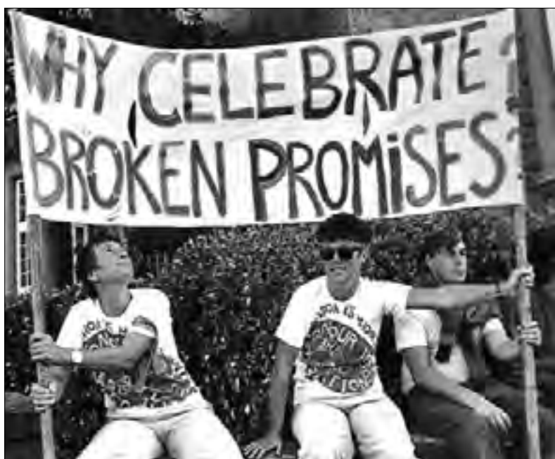
Waitangi Day protest, Wellington, 1987.

“Pacific peoples were brought here largely because industry in the 1960s needed cheap labour. Today they are blamed for many of the ills of unemployment and homelessness. We forget that as Pākehā, we are descended from migrants. How long do Pacific Islanders have to be here before they lose the stigma of migrant? We forget, too, the relationships which have existed between the white New Zealand government and the peoples of the Pacific” (R Coventry & C Waldegrave, Poor New Zealand , p. 67).