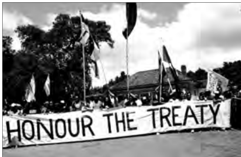
Waitangi, February 2006.