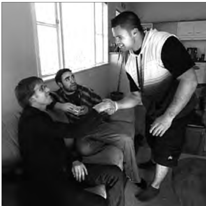
A still from Te Whare/The House , a Treaty education DVD, which depicts the history of the Treaty relationship as a contemporary flattening story. © 2008 Ugly Films; Director/Writer Richard Green.

In 1975 the Waitangi Tribunal was established. Although it seems to have been established principally to allay rising Māori protest of the time, it has had a key role in applying the Treaty to what is happening in the country today. In the Muriwhenua Fishing Report of June 1988, the Tribunal spoke of the practical application of the Treaty for the modern world: "Any impracticality today results not from the Treaty, but from our failure to heed its terms.