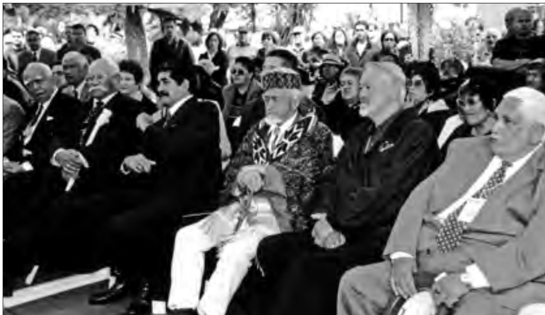
Kaumātua at the launch of Māori Television in March, 2004.

is not just a bill of rights for Māori ... we must remember that if we are the tangata whenua, the original people, then the Pākehā are tangata Tiriti, those who belong to the land by right of that Treaty.” The Treaty is also a bill of rights for non-Māori.