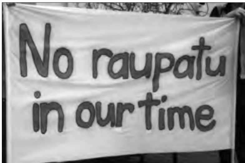
Banner from the Pākehā campaign of the same name, linking the foreshore and seabed legislation to earlier raupatu (confiscations), launched on 28 October 2003.