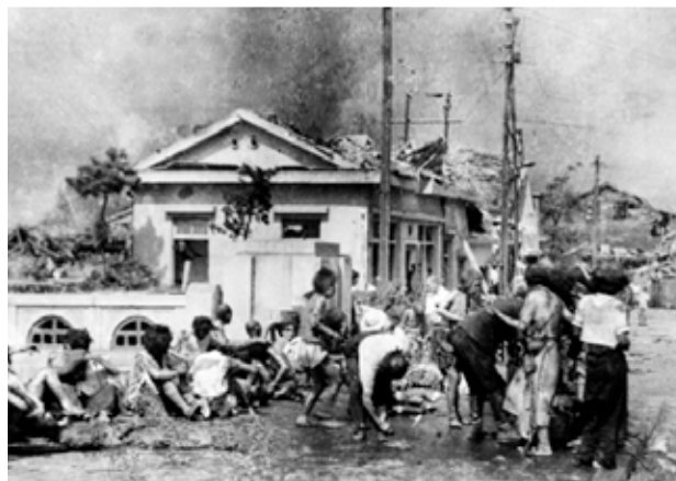
Injured civilians in Hiroshima, 6 August 1945